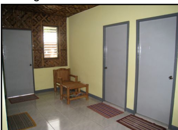
Entrance and doors to bedrooms