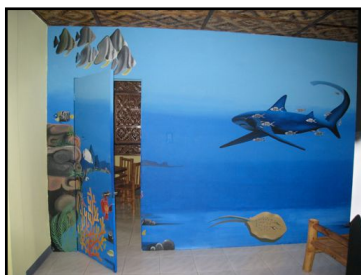
Living room and door to kitchen

On 23 September, TSRCP hosted it's first volunteer research assistant in the new guest house. Located just behind BB's Lodging House, the facility is community based, with three private bedrooms, two bathrooms, a large living room and a kitchen with dining area. The guest house boasts two wall murals, both painted by a local artist who goes by the name 'Kulot' and includes the largest shark on the island . “I wasn't expecting to be so comfortable” said Ryan Booker, TSRCP's latest volunteer RA.