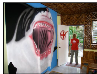
Main entrance and bathroom doorway