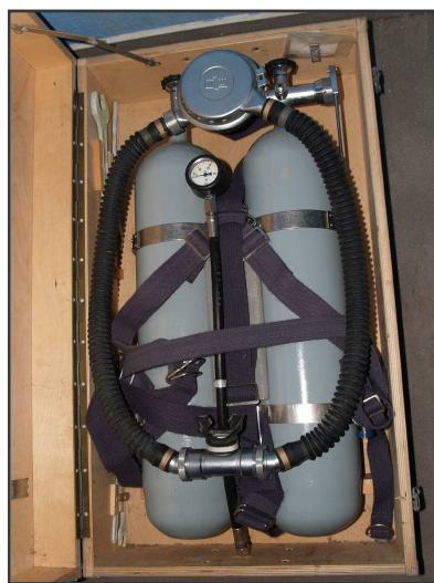
MEDI Hydromat 62028

The SCUBA lite MEDI 713 was followed 1965 by the best product of MEDI, the modular (1- to 3- cylinders) SCUBA rig "Hydromat PTG" (Pressluft- Tauchgeraet = compressed air diving apparatus), first with a two-stage double hose regulator "Hydromat 62004 G01" and from 1970 onwards additionally with the single hose regulator "Hydromat 66" (62017).