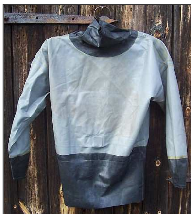
Drysuit Penguin without valves

Additionally MEDI/MLW produced cylinder valves, full face masks, the "Penguin" dry suit and other gear for professional diving.