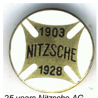
25 years Nitzsche AG, anniversary Medal

So these were more or less the traditions of making diving equipment in the GDR, more precisely in Leipzig.