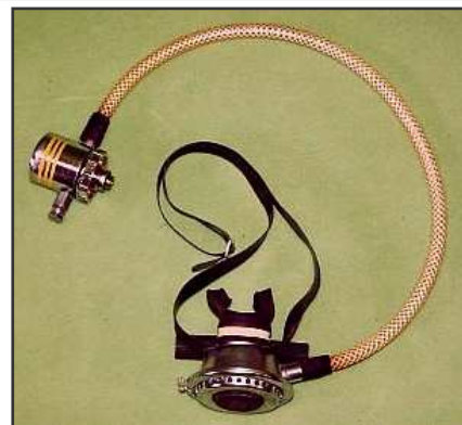
MEDI Hydromat 66

MEDI produced this family till 1974 with some light changes.