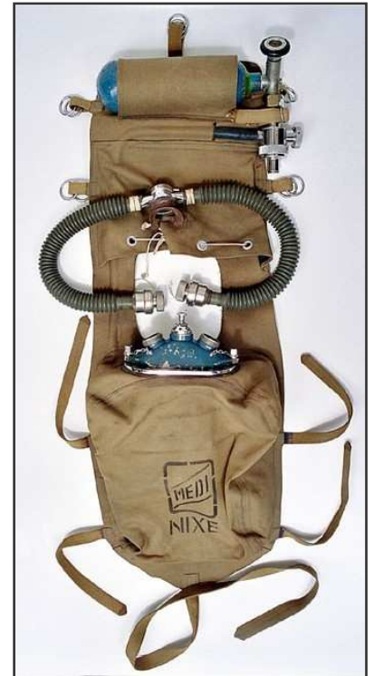
MEDI Nixe (Mermaid)

The MEDI diving gear production began in 1954 starting with the MEDI Nixe "Mermaid", a simple O 2 rebreather. The initialization came from the almighty SMAD that awaited of a country with submarine escape experience (Dräger U- Boot Rescue) that they could also build O 2 rebreathers. By now MEDI had developed and produced rescue rebreathers for mining and chemical industry too and the designing engineers could use these experiences. The Mermaid was produced until 1959.