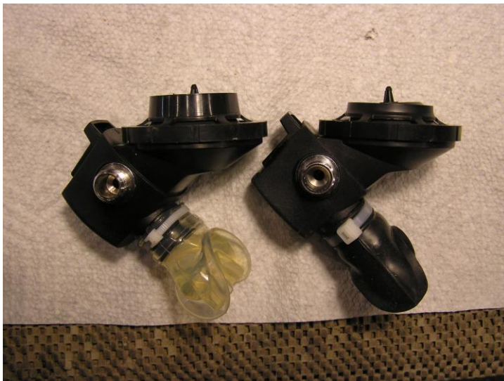
Tall Diaphragm Cover Short Diaphragm Cover