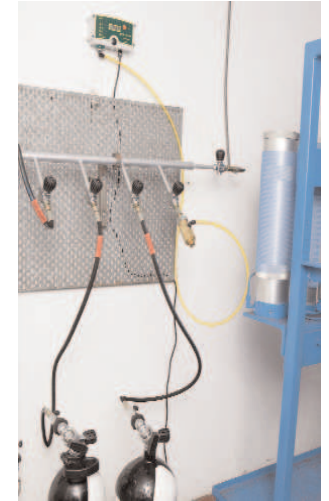
CO Clear TM in use

By installing an Analox CO Clear TM you can assure your customers that their tank fills are free from Carbon Monoxide. Your customers will have faith in their fill knowing it has been continuously monitored. Go above and beyond - fit an Analox CO Clear TM