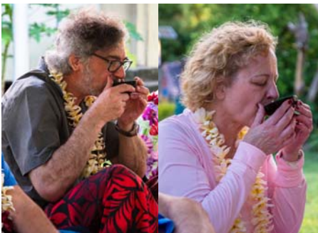
Yummy kava (May I have some more?)