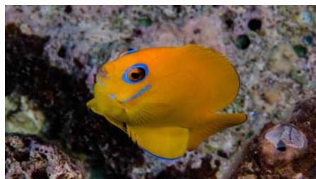
Lemonpeel Angel (personal favorite)