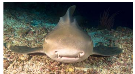
Zebra Shark (aka Leopard Shark)