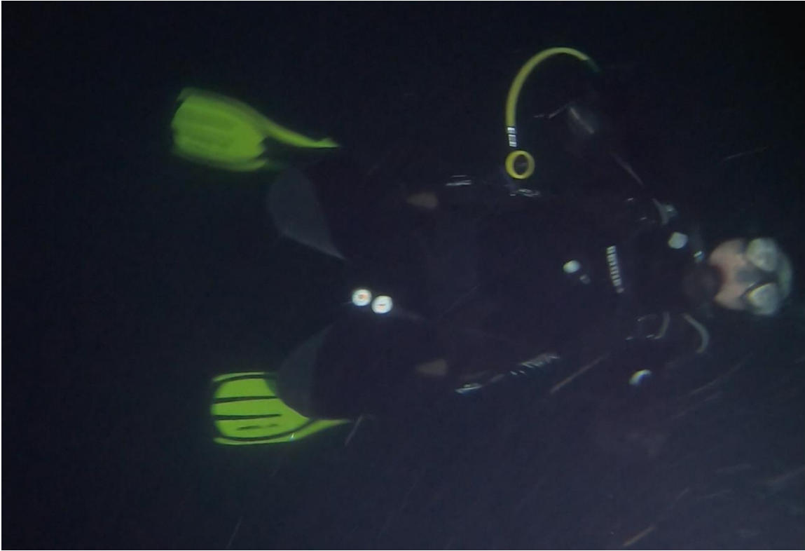
Fig. 3 – Linnea Mills falling to the bottom of Lake McDonald