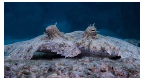
Head-on Peacock Flounder