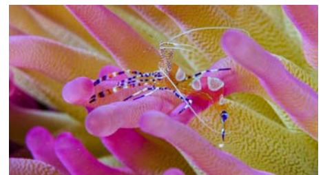
Spotted Cleaner Shrimp