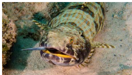
Lizardfish with a Needlefish meal