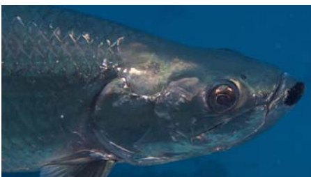
Up close with a Tarpon