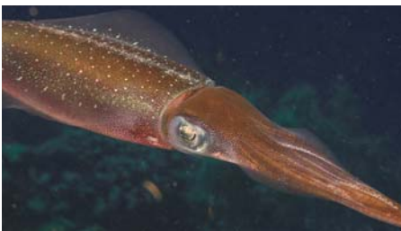
Squid at South Bay